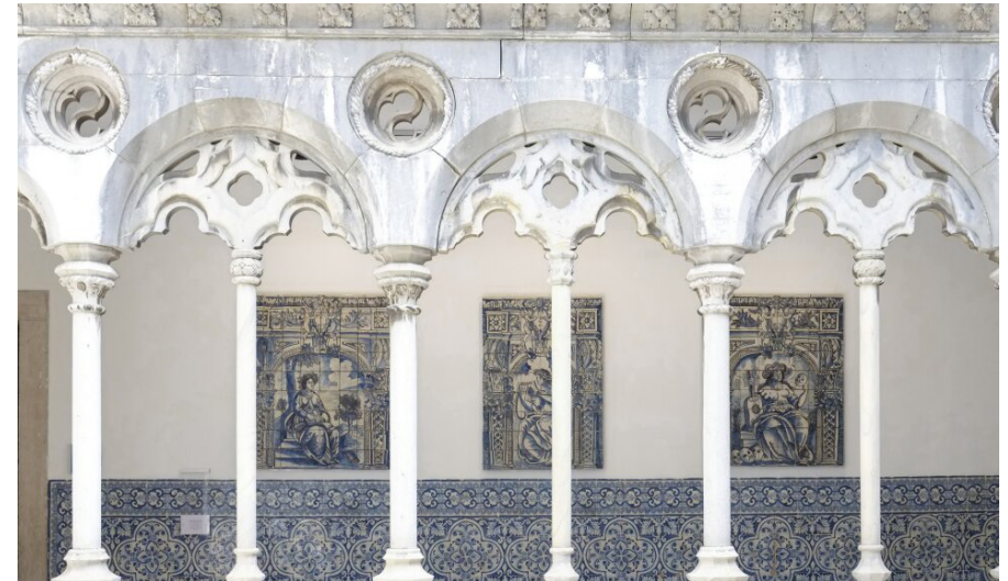
Museu Nacional de Azulejo