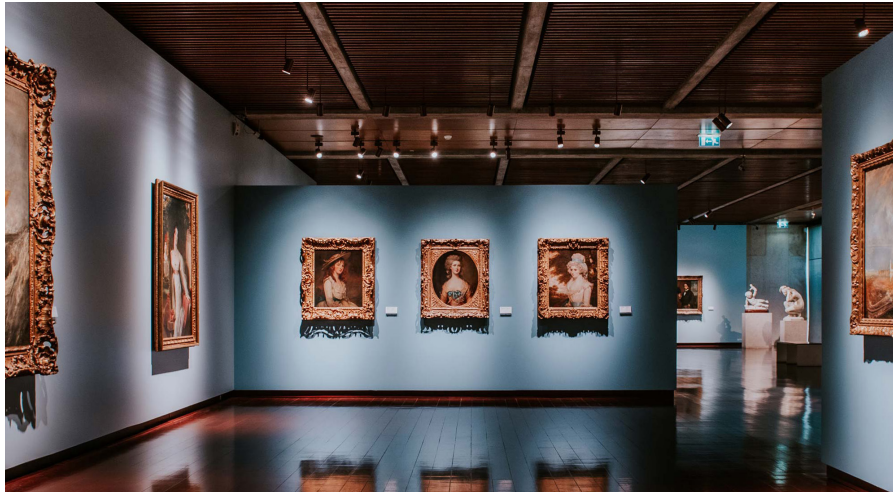
Museu Calouste Gulbenkian