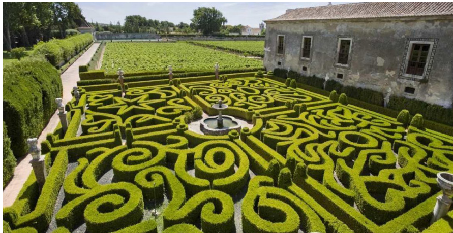
Palacio de Bacalhôa