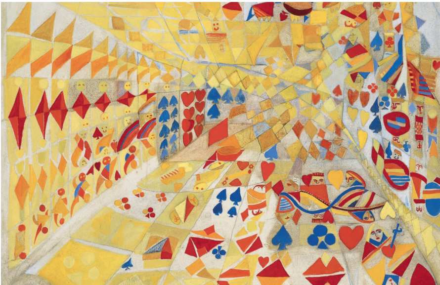
Maria Helena Vieira da Silva, 'Les jeu decartes', 1937