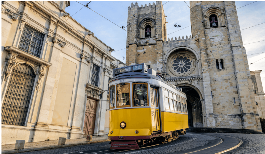
The famous yellow icon of Lisbon