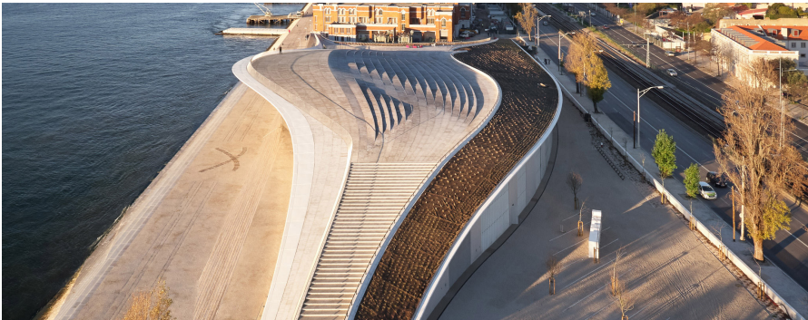
Museu de Arte, Arquitetura e Tecnologia

We continue to MAAT - Museu de Arte, Arquitetura e Tecnologia . Located on the riverfront in Lisbon's historical Belém district, MAAT comprises a former power station built in 1908 and a remarkable contemporary museum designed by Amanda Levete Architects. It is an innovative project which establishes a connection between the new building and Central Tejo Power Station, one of Portugal's most prominent examples of industrial architecture from the first half of the 20th century. MAAT's ambition is to present national and international exhibitions by contemporary artists, architects and thinkers.