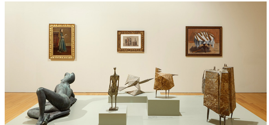
MAC/CCB Museu de Arte Contemporânea

We return to Belém for a visit to MAC/CCB - Museu de Arte Contemporânea . Formerly known as the Berardo Collection Museum, the MAC/CCB houses one of Lisbon's most acclaimed modern and contemporary art collections, which is also recognized as one of Europe's best. The museum collection offers a global perspective of visual arts from the 20th century to today, with an emphasis on European and American art. Among the highlights are Warhol's "Portrait of Judy Garland", Picasso's "Femme dans un Fauteuil (Métamorphose)", Roy Lichtenstein's "Interior With Restful Paintings" and Paula Rego's "The Barn".