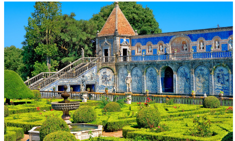
Palácio dos Marqueses de Fronteira

Following our tour, we will make our way to dinner at a local restaurant.