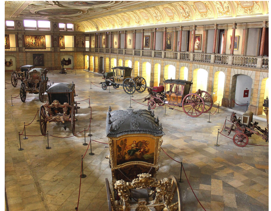
Museu Nacional dos Coches

We conclude our afternoon at the Museu Nacional dos Coches . The museum's coach collection is now divided between a newly built modern museum and the 18th century royal riding hall, which was commissioned by Dom João V in 1726. The museum's remarkable collection is one of the largest and most valuable in the world. Heavily gilded and painted carriages made in Portugal, Italy, France, Austria and Spain date from the 16th to the 19th centuries.