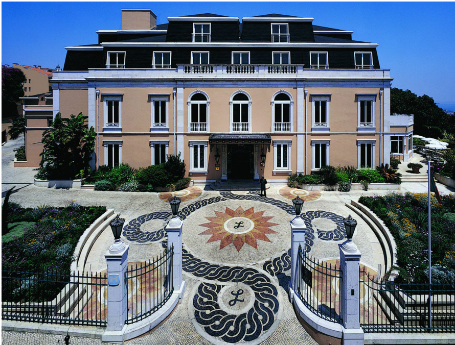
Above: Olisippo Lapa Palace Hotel Front cover: MAAT