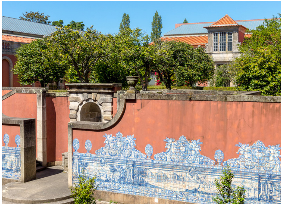
Museu Nacional de Soares dos Reis

We return to the hotel for some time at leisure.