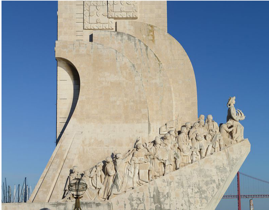
Monument to the Discoveries

After lunch, we walk to The ' Monument to the Discoveries ', one of Portugal's most iconic landmarks, first conceived by the architect José Ângelo Telmo in 1940 as part of the Portuguese World Fair. In 1958, it was decided that a permanent monument was needed to celebrate the achievements of Portuguese mariners and the royal patrons involved in the development of the Portuguese Age of Discovery, and to commemorate the 500th anniversary of the death of Prince Henry the Navigator.