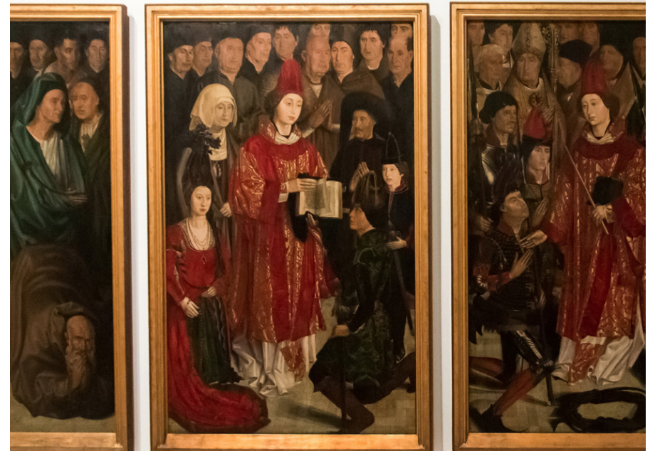
Panels of St Vincent by Nuno Gonçalves

We also visit the outstanding, recently re-opened CAM - Centro de Arte Moderna Gulbenkian , which has been redesigned and reimagined by Kengo Kuma. CAM holds the largest and most complete collection of modern and contemporary Portuguese art, as well as works by international artists. The surrounding garden has been redesigned by landscape architect Vladimir Djurovic to create a fusion between architecture and landscape.