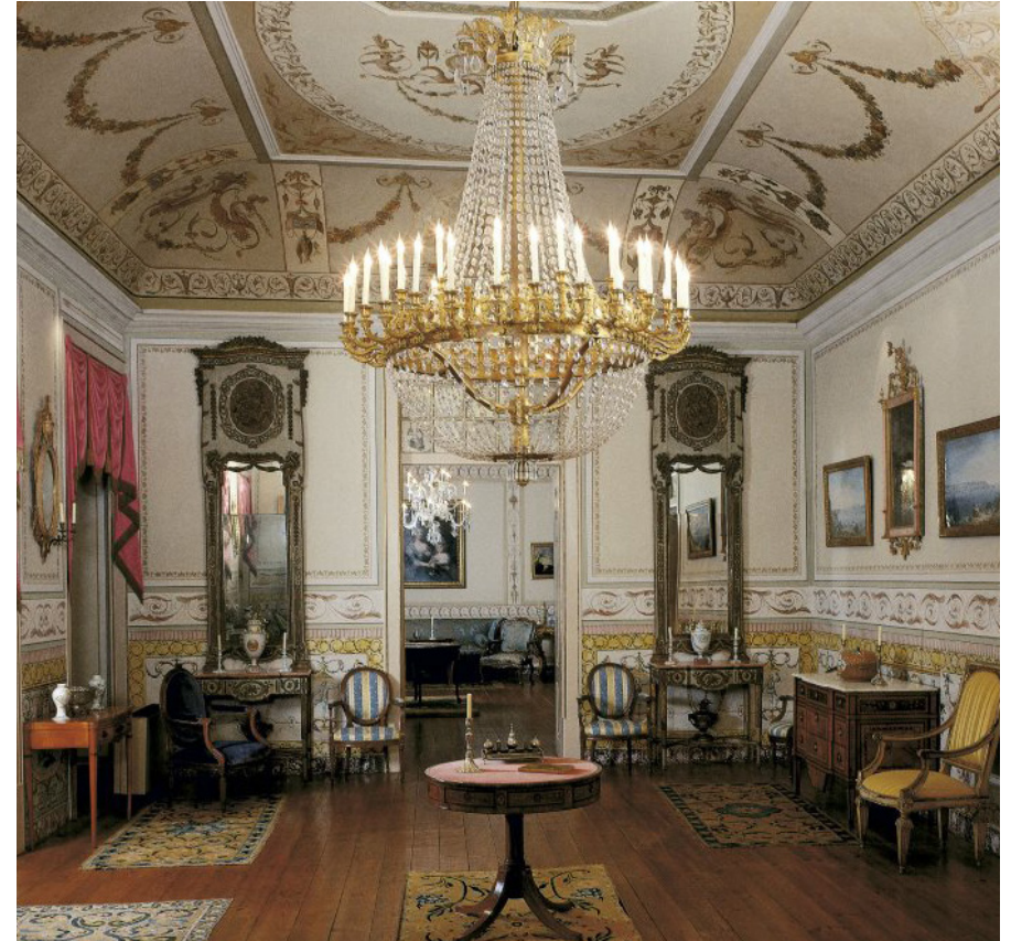
Museu-Escola de Artes Decorativas