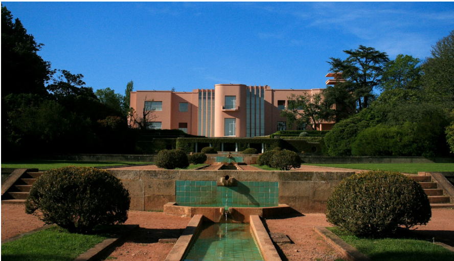
Fundação de Serralves